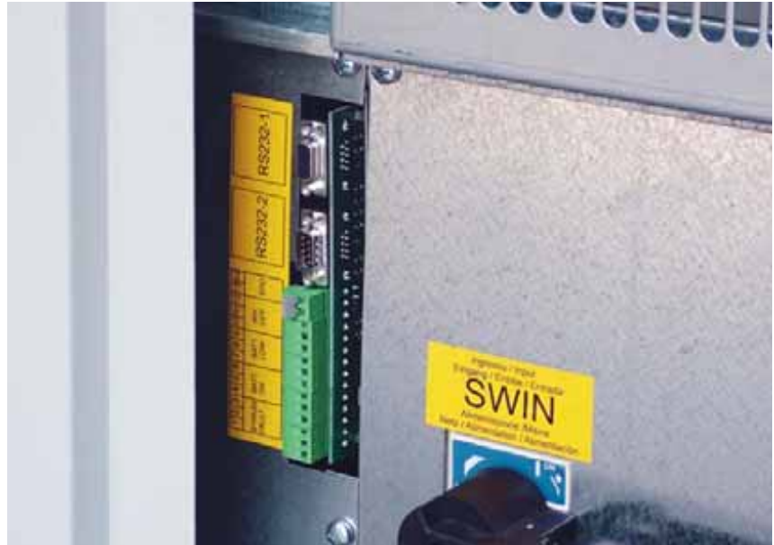
Details of the connection